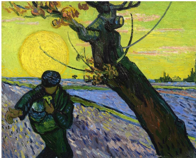
"The Sower" Vincent van Gogh